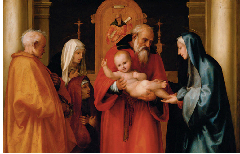
Fra Bartolomeo (1472–1517), Presentation of Christ in the Temple