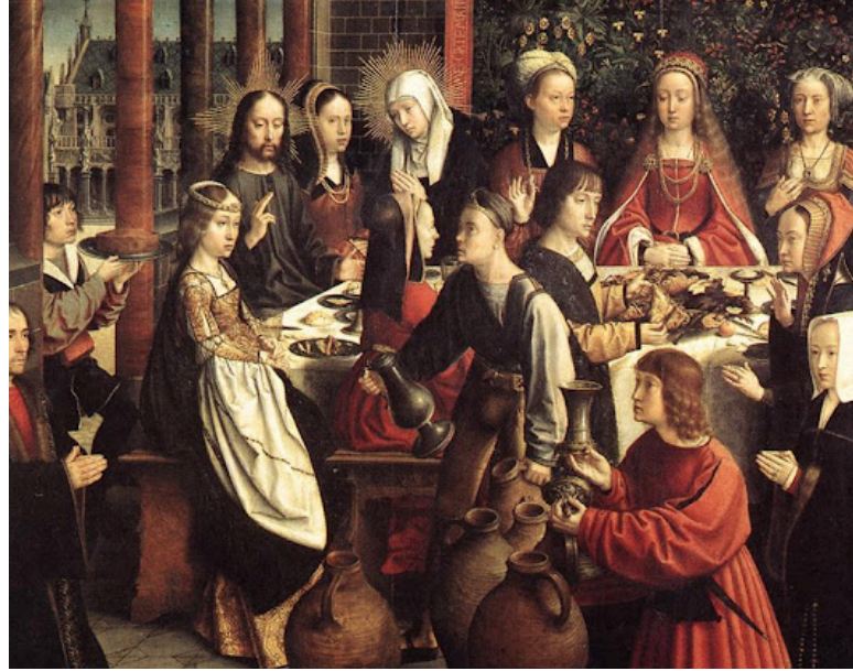
Gerard David (circa 1450/1460–1523), The Marriage at Cana

There is a variety of gifts but always the same Spirit; there are all sorts of service to be done, but always to the same Lord; working in all sorts of different ways in different people, it is the same God who is working in all of them. The particular way in which the Spirit is given to each person is for a good purpose. One may have the gift of preaching with wisdom given him by the Spirit; another may have the gift of preaching instruction given him by the same Spirit; and another the gift of faith given by the same Spirit; another again the gift of healing, through this one Spirit; one, the power of miracles; another, prophecy; another the gift of recognising spirits; another the gift of tongues and another the ability to interpret them. All these are the work of one and the same Spirit, who distributes different gifts to different people just as he chooses.