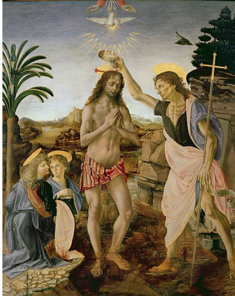
Andrea del Verrocchio (1435-1488) & Leonardo da Vinci (1452-1519), The Baptism of Christ

When the kindness and love of God our saviour for mankind were revealed, it was not because he was