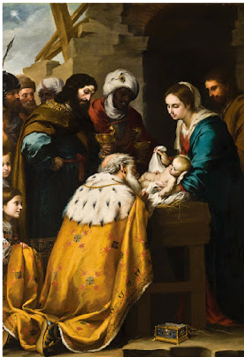
Bartolomé Esteban Murillo (1617–1682), Adoration of the Magi

After Jesus had been born at Bethlehem in Judaea during the reign of King Herod, some wise men came to Jerusalem from the east. 'Where is the infant king of the Jews?' they asked. 'We saw his star as it rose and have come to do him homage.' When King Herod heard this he was perturbed, and so was the whole of Jerusalem. He called together all the chief priests and the scribes of the people, and enquired of them where the Christ was to be born. 'At Bethlehem in Judaea,' they told him, 'for this is what the prophet wrote: