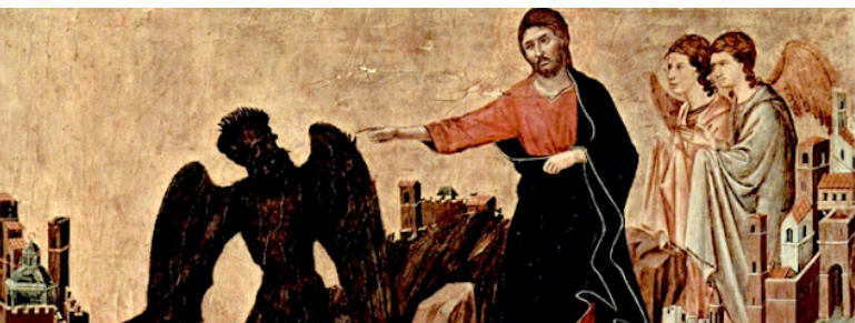
Duccio di Buoninsegna (1319), Temptation of Christ on the Mount

His love he set on me, so I will rescue him; protect him for he knows my name. When he calls I shall answer: 'I am with you.' I will save him in distress and give him glory. R