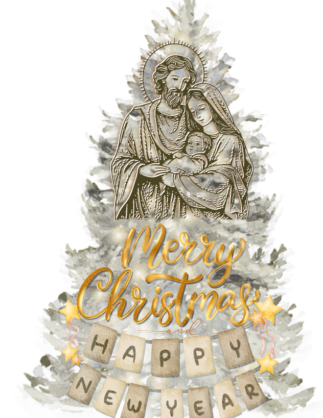
Licensed copy. Unauthorised copying prohibited. Used with permission. St Joseph's Parish - Camperdown Licence No 4902. Scripture texts from the Jerusalem Bible, Copyright 1996 by Darton, Longman & Todd Ltd & Doubleday and Company Inc.

Our God has appeared on the earth, and lived among us.