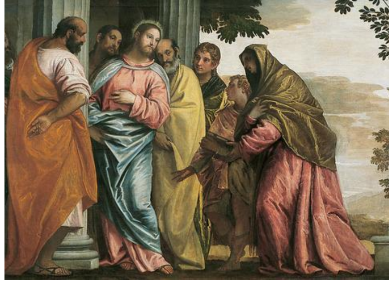
Paolo Veronese (1528–1588), Christ meeting the wife and the sons of Zebedee

James and John, the sons of Zebedee, approached him, 'Master,' they said to him 'we want you to do us a favour.' He said to them, 'What is it you want me to do for you?' They said to him, 'Allow us to sit one at your right hand