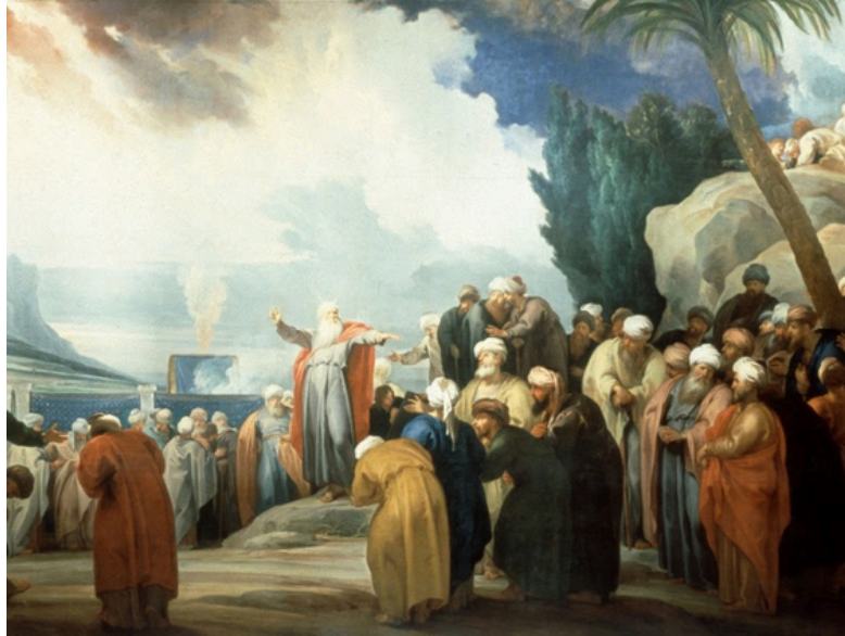
Jacob de Wit (1695-1754), Moses elects the Council of Seventy Elders

It was you who condemned the innocent and killed them; they offered you no resistance.