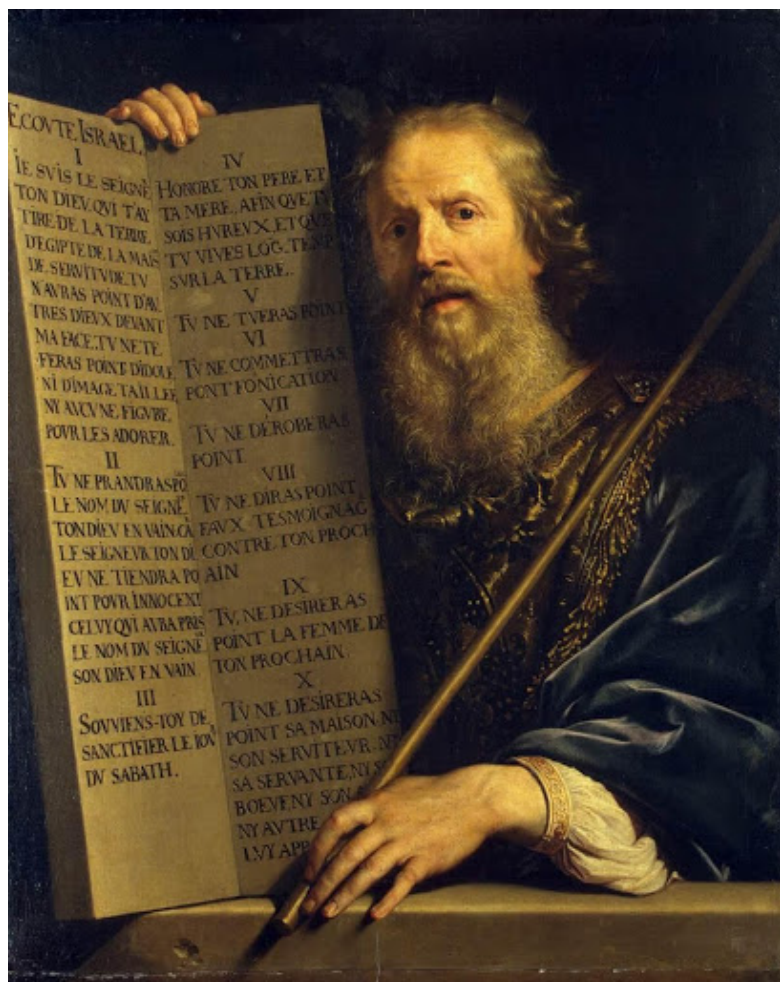
Philippe de Champaigne (1602-1674), Moses with the Ten Commandments

The Pharisees and some of the scribes who had come from Jerusalem gathered round Jesus, and they noticed that some of his disciples were eating with unclean hands, that is, without washing them. For the Pharisees, and the Jews in general, follow the tradition of the elders and never eat without washing their arms as far as the elbow; and on returning from the market place they never eat without first sprinkling themselves. There are