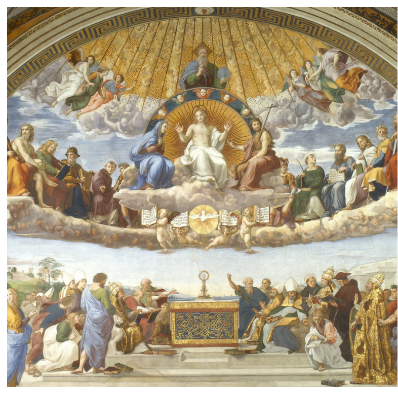
Raphael (1483–1520), Disputation of Holy Sacrament

Alleluia, alleluia! I am the living bread from heaven, says the Lord; whoever eats this bread will live forever. Alleluia!