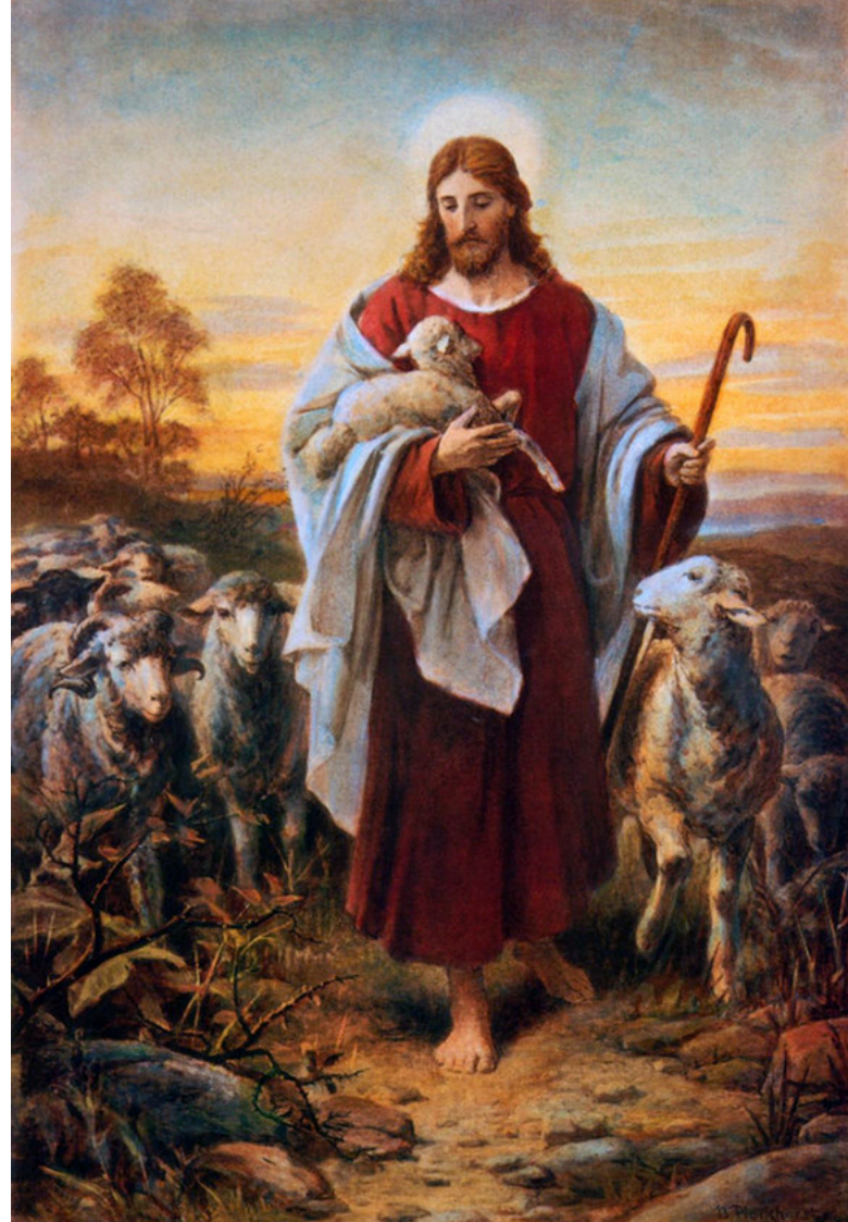
Bernhard Plockhorst (1825–1907), Good Shepherd

In Christ Jesus, you that used to be so far apart from us have been brought very close, by the blood of Christ. For he is the peace between us, and has made the two into one and broken down the barrier which used to keep them apart, actually destroying in his own person the hostility caused by the rules and decrees of the Law. This was to create one single New Man in himself out of the two of them and by restoring peace through the cross, to unite them both in a single Body and reconcile them with God. In his own person he killed the hostility. Later he came to bring the good news of peace, peace to you who were far away and peace to those who were near at hand. Through him, both of us have in the one Spirit our way to come to the Father.